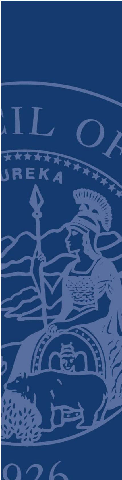
Exhibit C: AOC Tool Control Policy