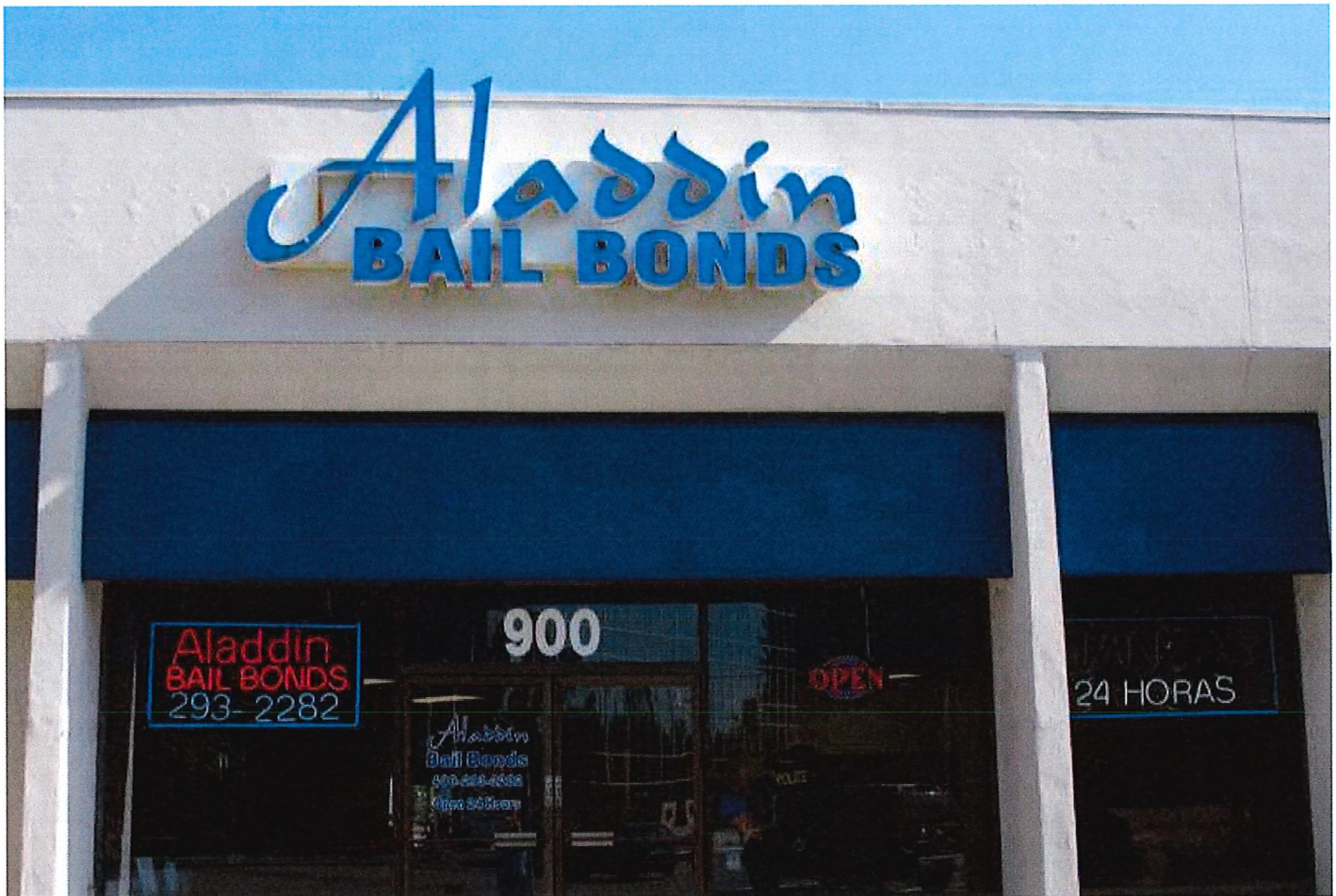
Aladdin Bail Bonds was one of seven companies whose agents were arrested for alleged illegal business practices, including bail capping.