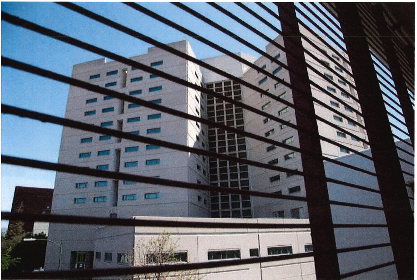
For years bail bonds agents used inmates inside the Santa Clara County Main Jail to drum up new business.

By hiding the ultimate targets of their calls, inmates could use the free calls to intimidate witnesses or run other criminal activities from behind bars, putting the public at risk.