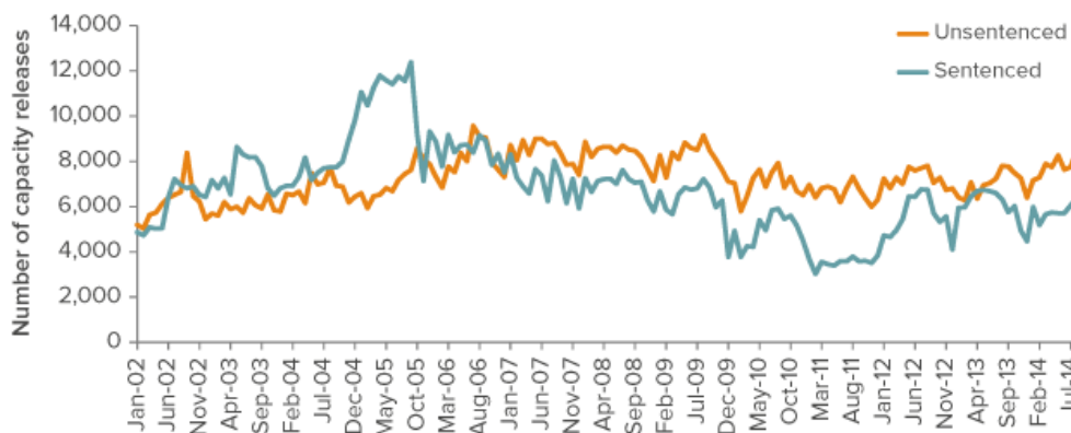
Figure 1. Jail overcrowding has led to the release of thousands of inmates