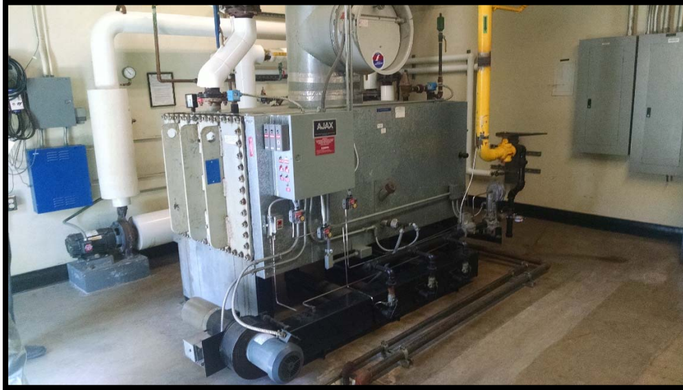
Above: Failing existing 3 MBTU Boiler (Parts no longer being fabricated). Below: New 1.4 BTU Boilers (No operating permits required and much more efficient).