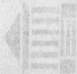
San Francisco Superior Court

Nếu vụ của quý vị là về bạo hành trong nhà, Tòa có thể cung cấp thông dịch viên cho quý vị. Hãy hỏi học sự trong Phòng 402.