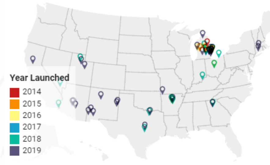
Court Annexed ODR in United States

Other courts are in various stages of piloting ODR programs