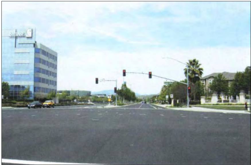
Dublin Blvd at Hacienda Drive looking north toward Project Site.