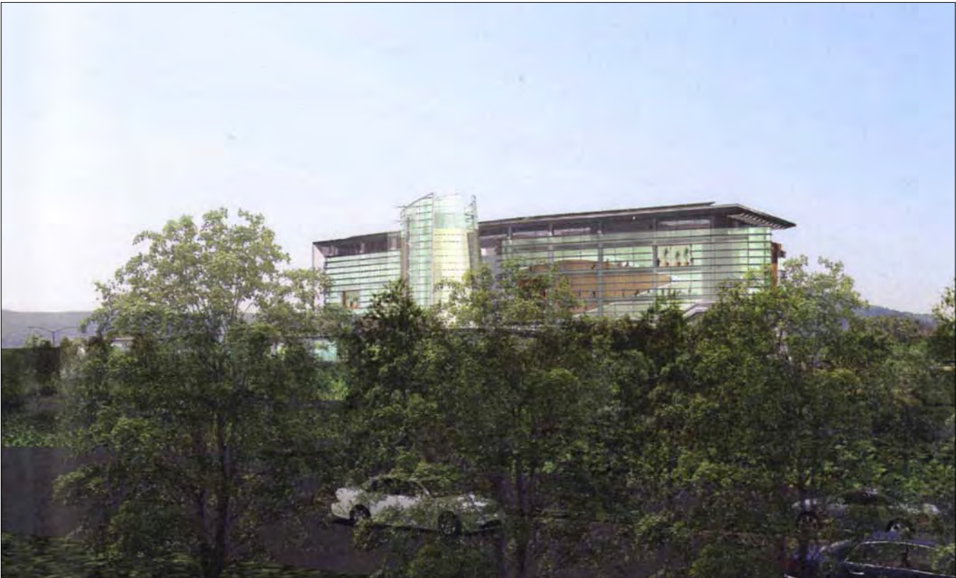
Figure 7 View from Second Floor of Gleason Dr. Residential Neighborhood