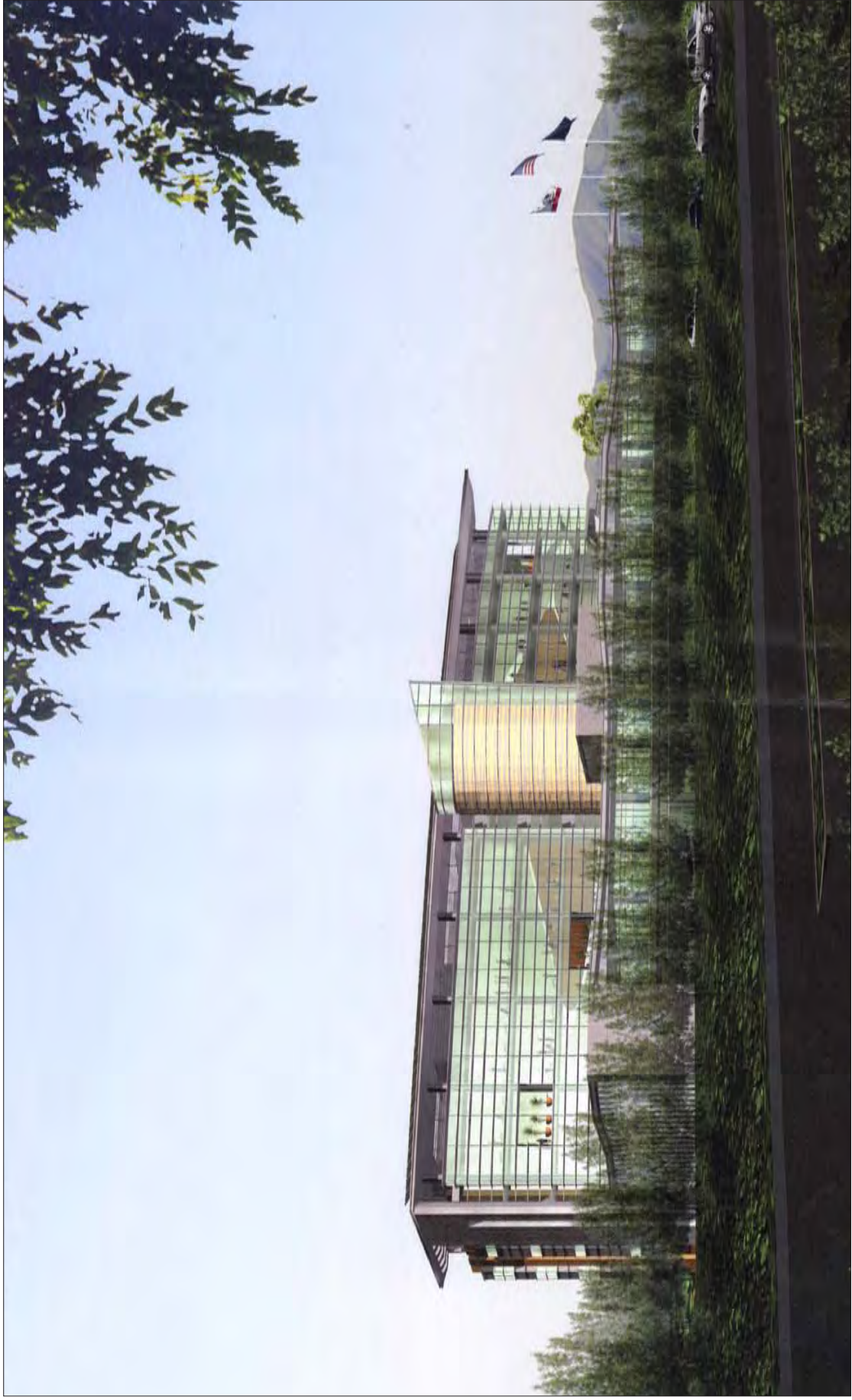
Figure 5 Southwest Elevation