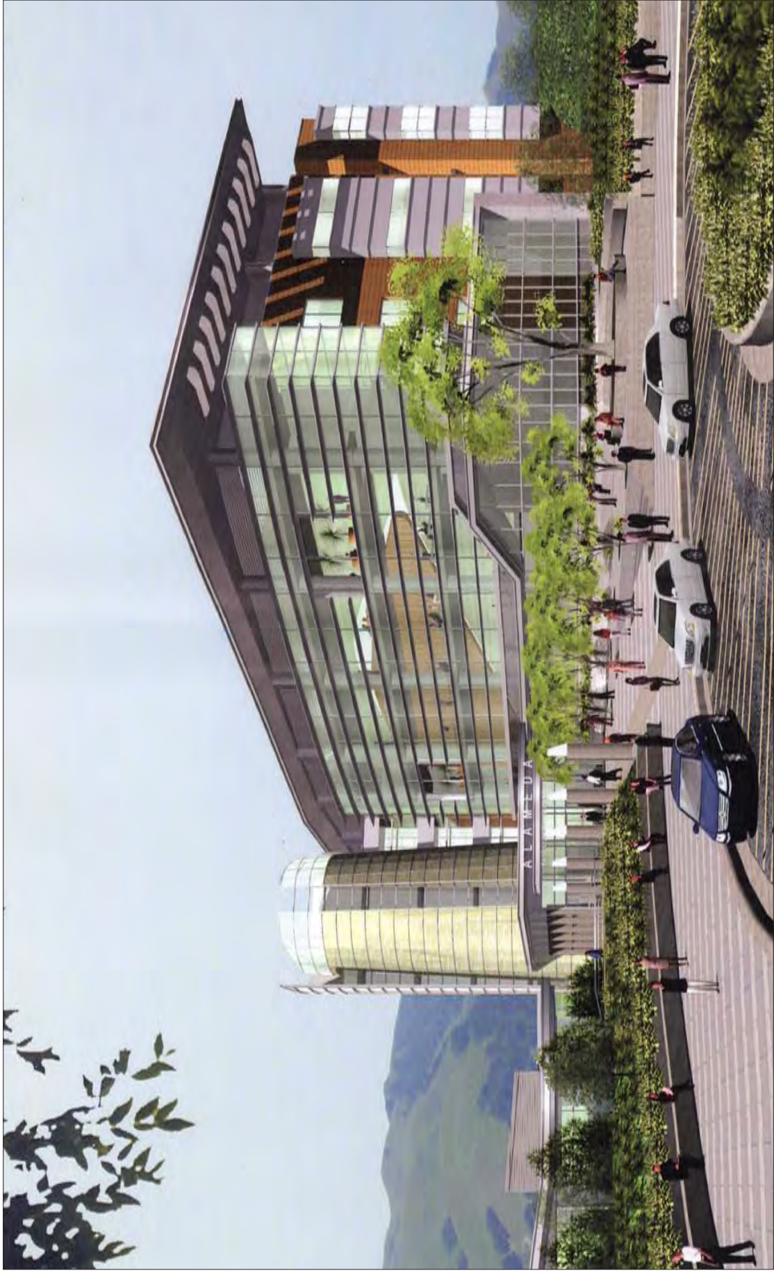
Figure 6 Southeast Elevation