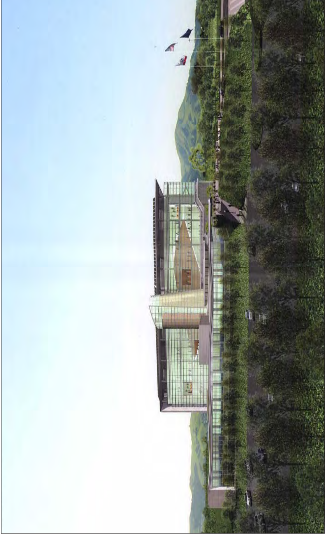
Figure 4 South Elevation