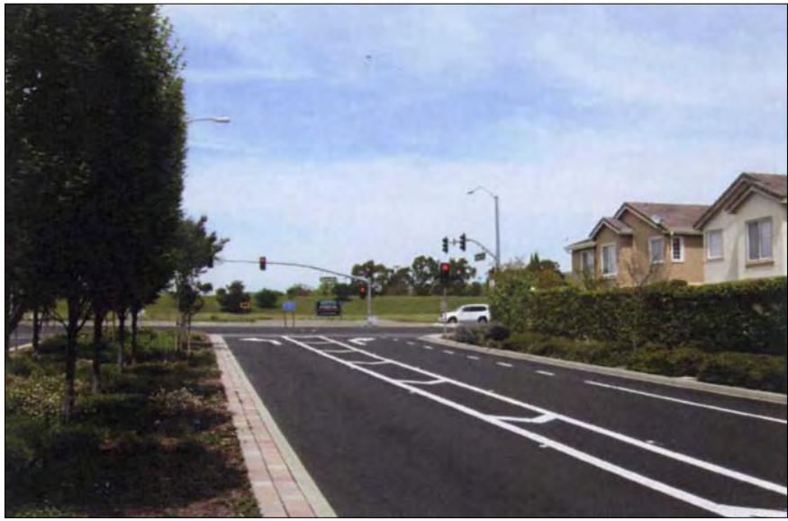
Hacienda Drive looking north toward Project Site at Gleason Drive.