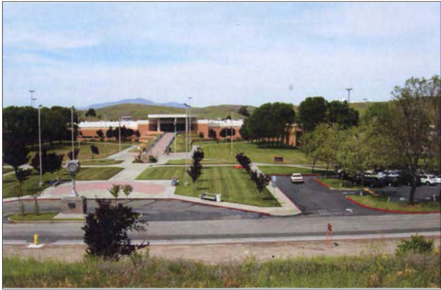
Project Site looking north across Broder Blvd. toward Santa Rita Jail.