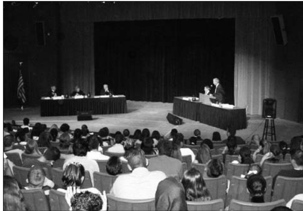
In September 2002 the Third Appellate District of the Court of Appeal held proceedings at a high school in Stockton, giving students a firsthand look at the appellate process.

It is customary for justices to interrupt an argument at any time to ask the attorney to address a specific point. The justices ask such questions to clarify issues of concern as they consider how to decide a case.