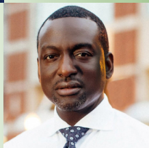
Yusef Salaam Member of the Central Park 5 (aka The Exonerated 5) Motivational Speaker Advocate of/for Criminal Justice Reform