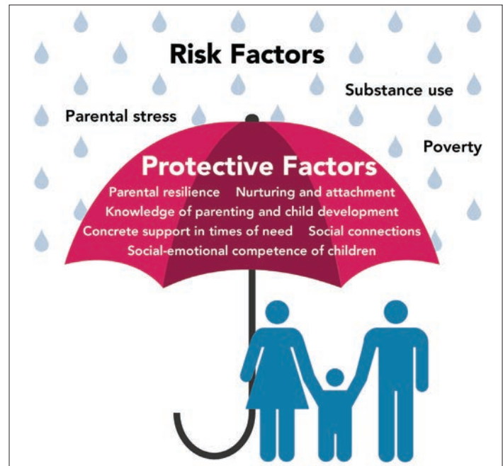
Figure 2. Risk and Protective Factors

For more information, visit Information Gateway’s Preventing Child Abuse & Neglect ( https://www.childwelfare.gov/topics/preventing/ ) and Responding to Child Abuse & Neglect ( https://www.childwelfare.gov/topics/responding/ ) web sections.