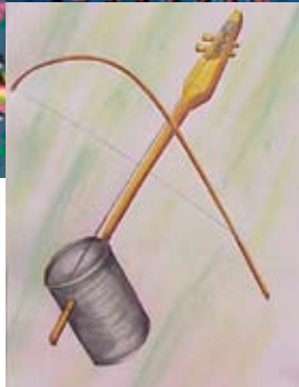
Examples of the Hmong culture are shown above, including a musical instrument called a Qeej (top left), a violin (bottom right), and two examples of the beautiful Hmong tapestries with scenes from a marriage ceremony, a hunt, and the traditional agricultural lifestyle.