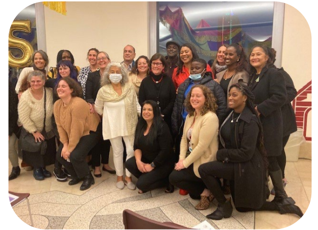
SF Family Treatment Court 15 year anniversary, with SF Mayor Breed. December 2022.