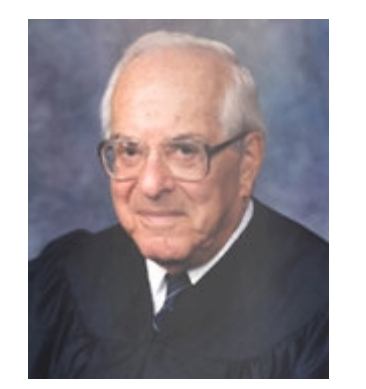
Justice Stanley Mosk

the PGA to eliminate its "Caucasian only" clause, enabling African-American Charlie Sifford to play in Tour events. Commenting on the Su-