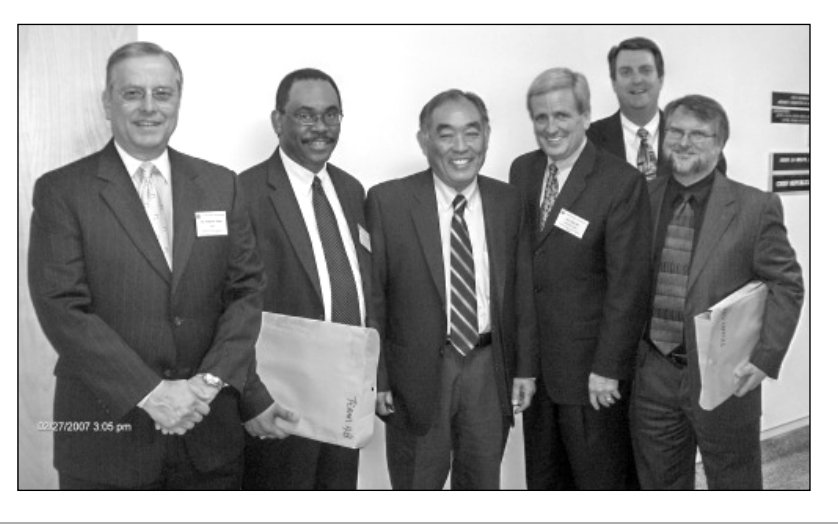
The Capitol Connection