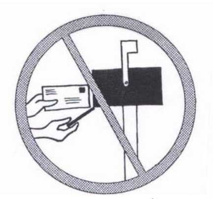
Don't serve it by mail!