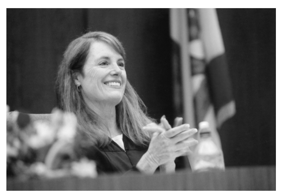
Judge Wendy Lindley, Superior Court of Orange County, congratulates participants in dual-diagnosis court serving non-violent drug offenders with mental health issues.

Problem-solving courts (or collaborative justice courts) include specialized drug courts, domestic violence courts, community courts, family treatment courts, DUI courts, mental health courts, peer/youth courts and homeless courts. Their aim is to address challenging problems—like drug addiction, domestic violence and juvenile delinquency—that society brings to courthouses across the country every day. While each of these courts targets a different problem, they all seek to use the authority of courts to improve outcomes for victims, communities and defendants. These court programs strive to achieve tangible results like safer streets and stronger families; at the same time, they seek to maintain the fairness and legitimacy of the court process.